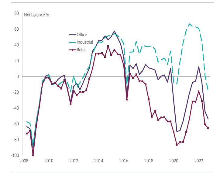
CAPITAL VALUE EXPECTATIONS - BROKEN DOWN BY SECTOR